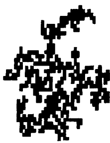
Figure 2. A typical cluster grown on a square lattice with d_l = 1.2 .